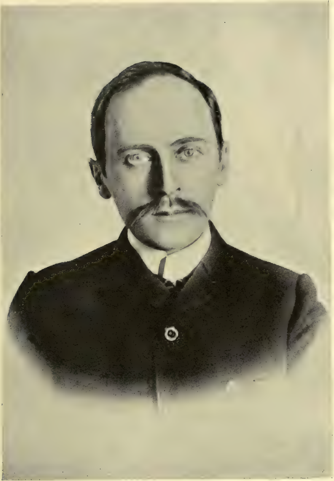
Romain Rolland at the time of writing Beethoven